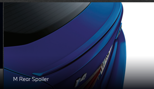
M Rear Spoiler