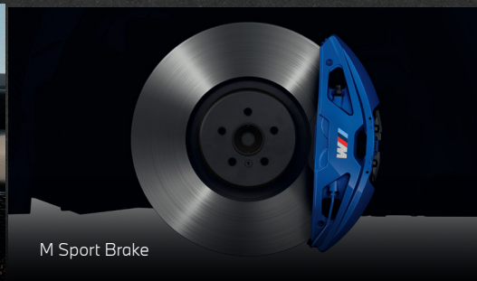
M Sport Brake