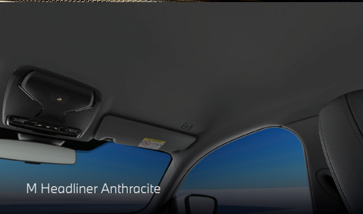
M Headliner Anthracite