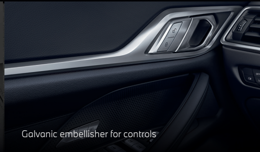
Galvanic embellisher for controls